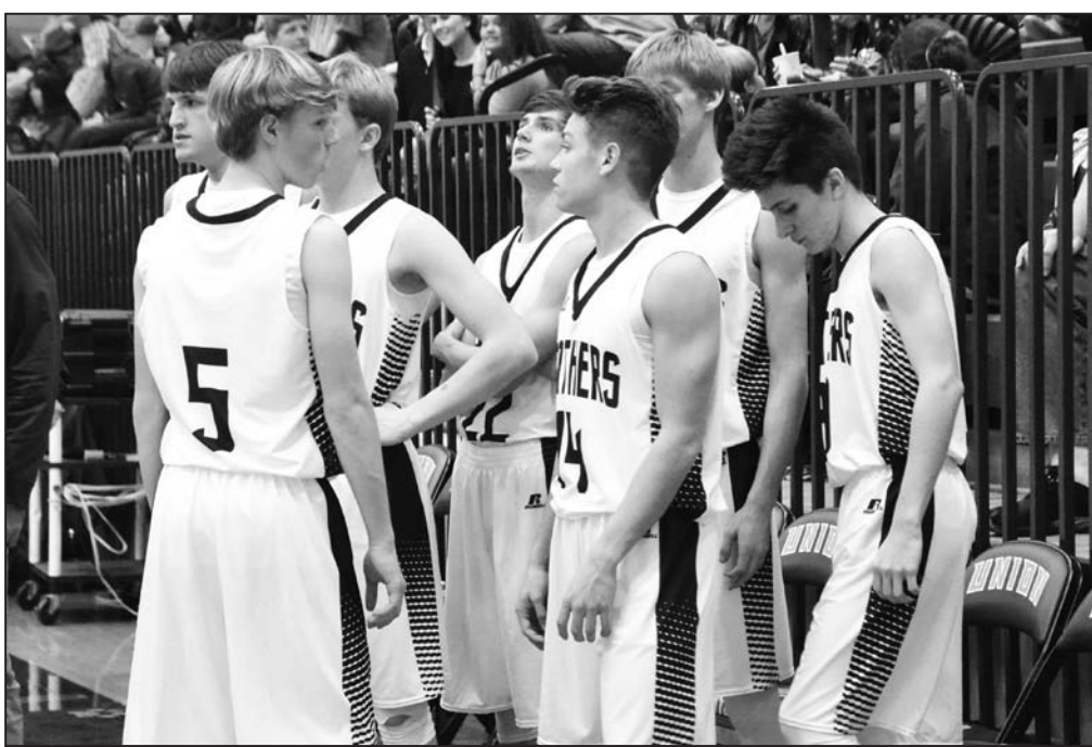
The Panthers will face off with Swain County, NC - one of the favorites in this year's Battle of the States. However, Union's three BOTS titles is the most in the history of the tournament. They also hold the record for the most BOTS title game appearances with four.